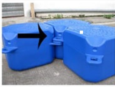
Join the pontoons - numbered 1, 2, 3 & 4