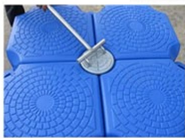
Use the provided tool to twist the centre joiner into a locked position