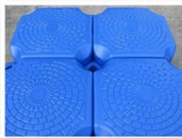
Push centre joiner firmly into the hole