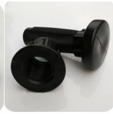
Bracing nut and bolt (edge)